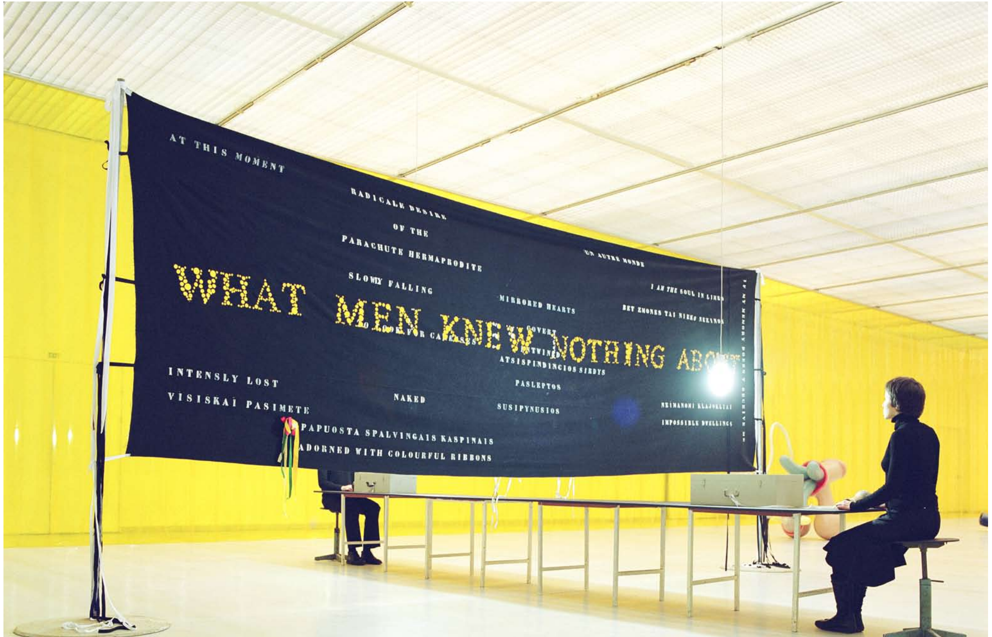
WHAT MEN KNEW NOTHING ABOUT